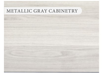
METALLIC GRAY CABINETRY